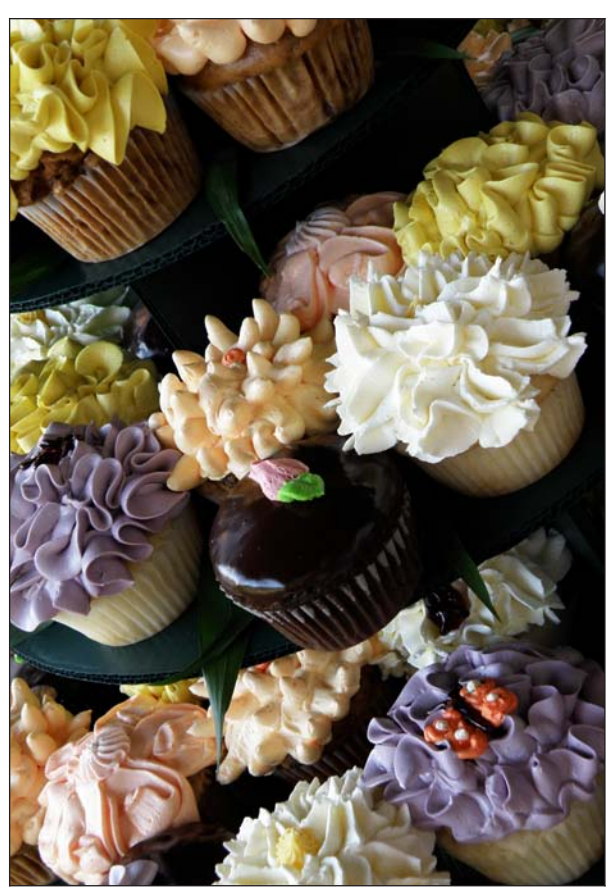
Cupcakes, like these from The Sisters McMullen, can make a great alternative to the typical birthday cake.

Let the folks at Chocolate Gems create one-of-a-kind chocolate sculptures for the birthday boy or girl. Or indulge each guest with their own chocolate box decorated with sugar flowers and leaves. At 106 W. State St., Black Mountain, 669-9105.