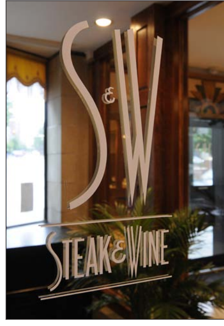
Etched into the glass of the front entrance of the S&W building is the logo for the Steak and Wine restaurant. one of the many downtown restaurants to take Dad to on Father's Day.

"Time spent fishing is quality time that leaves the kind of impression one never forgets and to