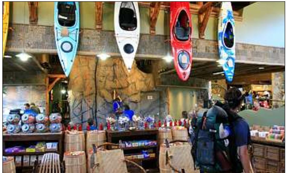
Enjoy the climbing wall at the new Nantahala Outdoor Center's Great Outpost in Gatlinburg.

Come to Pigeon Forge's WonderWorks and experience its 120 interactive adventures from the Space Lab to Bubble Zone. Defy gravity in the Inversion Tunnel or challenge yourself on the indoor rock climbing wall. Discover why the building itself is upside down as you continue your exploration. Cap the evening with a Hoot N' Holler family dinner show, located inside WonderWorks, or