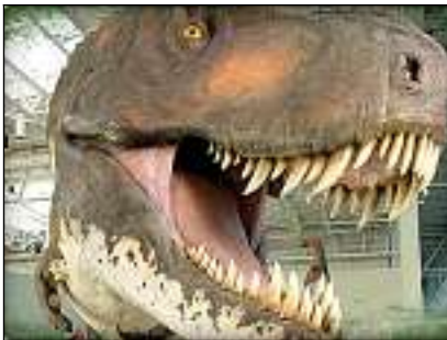
Find your favorite dinosaur at the Dinosaur Walk Museum in Pigeon Forge.

A prehistoric adventure awaits your family at Pigeon Forge's Dinosaur Walk Museum . Not mere fossils or bones, the museum features life-size sculptures of your favorite great beasts. The sculptures, created by some of the world's greatest paleo-artists, are meticulously constructed and some took more than a decade to build.