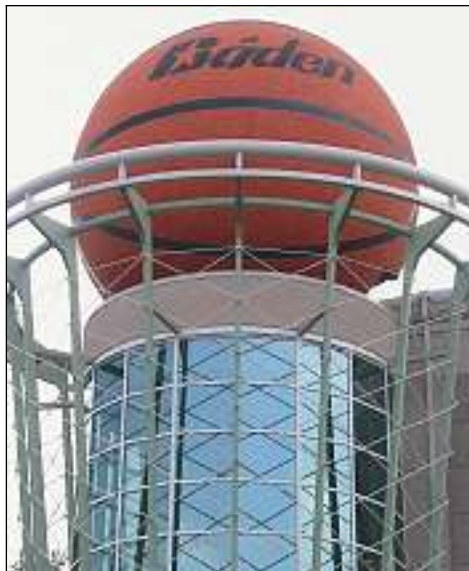
The Women's Basketball Hall of Fame in Knoxville is the only facility of its kind dedicated to all levels of women's basketball in the world.

" Knoxville Zoo is home to over 800 ani-