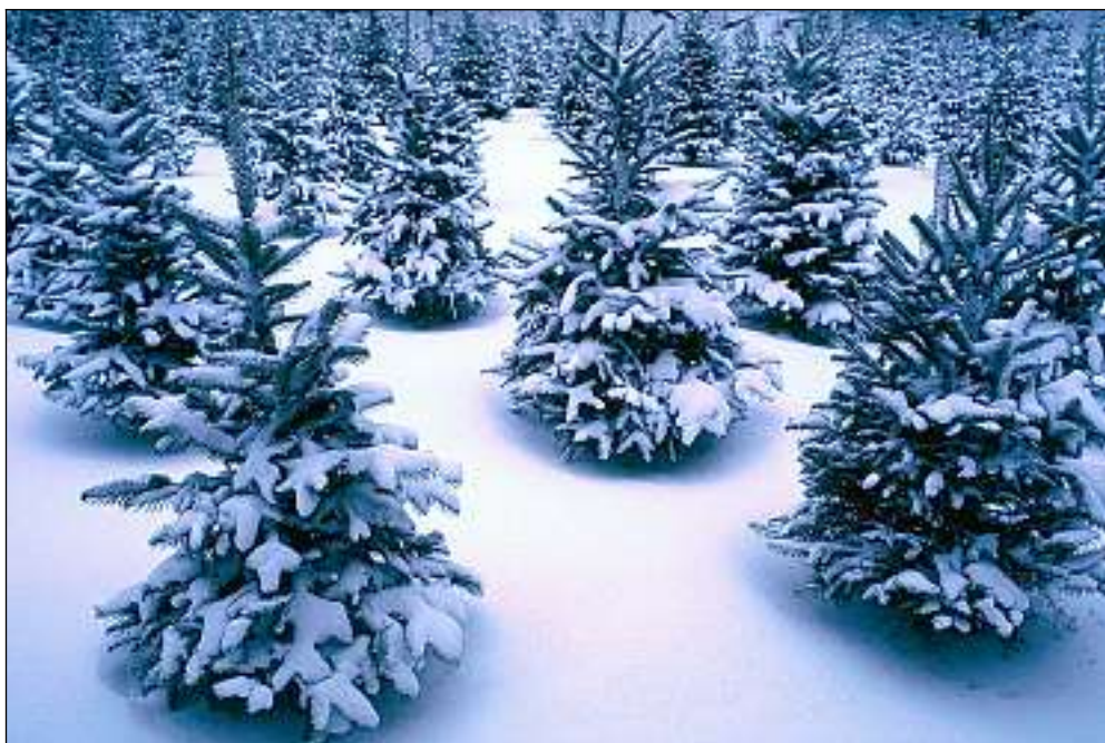
SPECIAL TO WNC PARENT/NC DIVISION OF TOURISM, FILM AND SPORTS DEVELOPMENT Trees covered in a blanket of snow are postcard-perfect in Boone.

“We offer several fun, family packages, including our Tweetsie Railroad, Choose Cut and Plant Package, and skiing packages,” notes Jessica B.