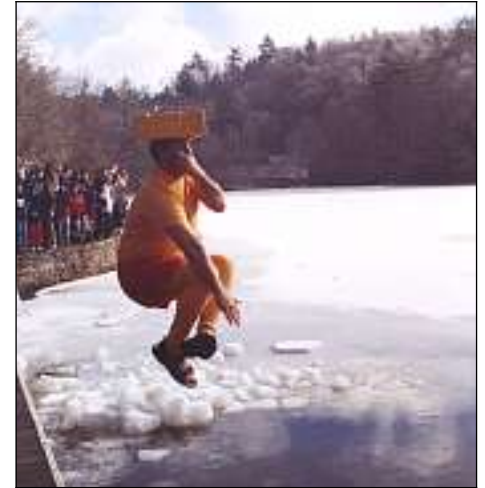
SPECIAL TO WNC PARENT/NC DIVISION OF TOURISM, FILM AND SPORTS DEVELOPMENT The natural wonders of the High Country transform into sparkling scenes in the winter months.